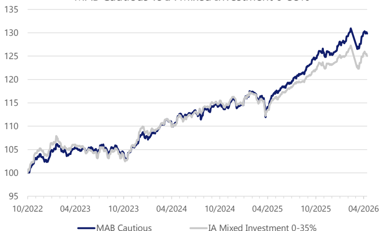
MAB Cautious vs IA Mixed Investment 0-35%

The Fund performance figures are presented net of the Ongoing Charges Figure (OCF) and are compared to the IA Mixed Investment 0-35% index. This is a risk-based index measuring the performance of investment managers with similar investment characteristics to the MAB Cautious fund.