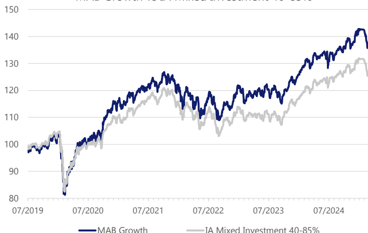
MAB Growth vs IA Mixed Investment 40-85%

The Fund performance figures are presented net of the Ongoing Charges Figure (OCF) and are compared to the IA Mixed Investment 40-85% index. This is a risk-based index measuring the performance of investment managers with similar investment characteristics to the MAB Growth fund.