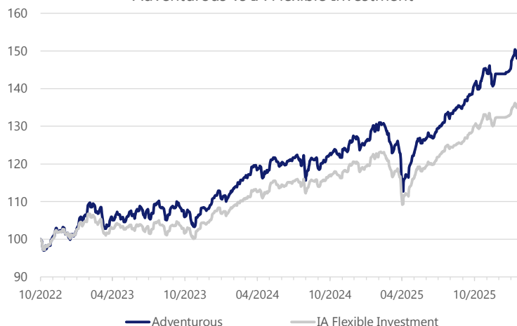
Adventurous vs IA Flexible Investment

The Fund performance figures are presented net of the Ongoing Charges Figure (OCF) and are compared to the IA Flexible Investment index. This is a risk-based index measuring the performance of investment managers with similar investment characteristics to the Adventurous fund.